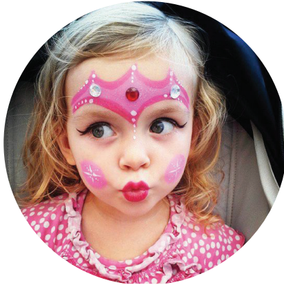
Professional facepainting by Susie 1.5hrs | $250