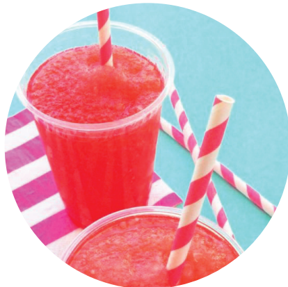
Slurpies | $120