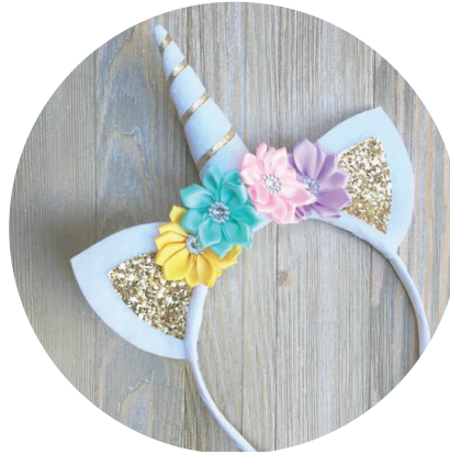
Make your own unicorn headband | $250