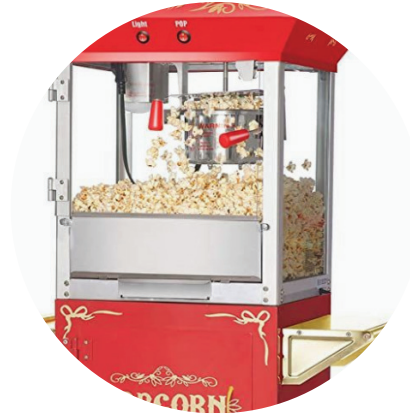
Popcorn | $120