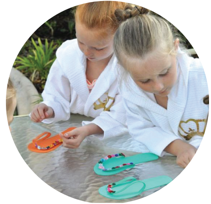
Bedazzle your own flipflops | $250