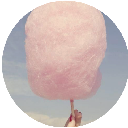
Fairy Floss | $120