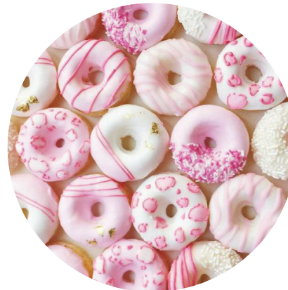
Donut Wall | $120 Includes 20 donuts Additional donuts $4 each