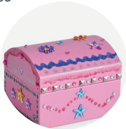
Paint your own jewellery box | $250