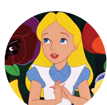
Alice in Wonderland